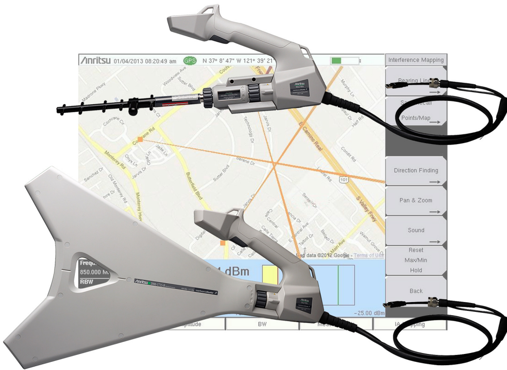
InterferenceHunter™ MA2700A Handheld Direction Finding System Compact Size: 303 mm x 220 mm x 70 mm (11.9 in x 8.7 in x 2.76 in), Lightweight: < 1 kg (2.2 lb)